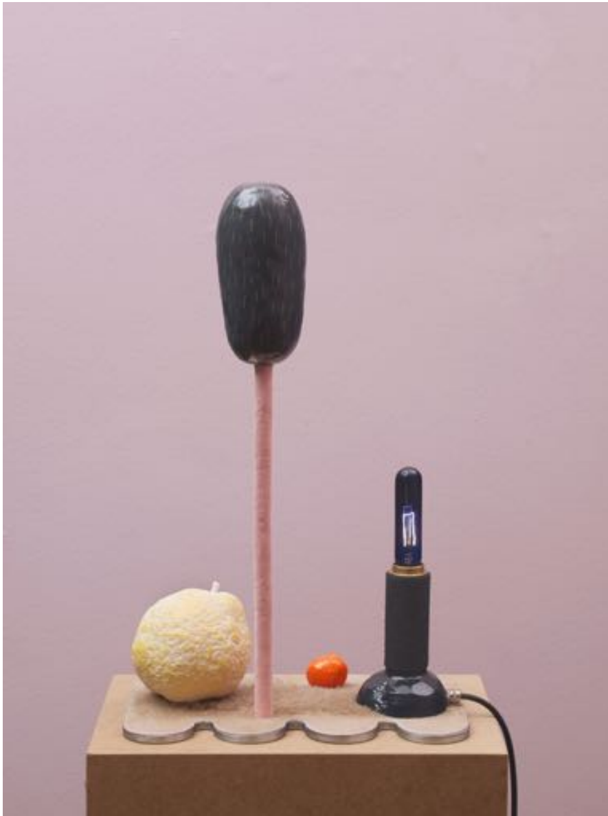
Mupiti Black Light

Painted bronze, stainless steel, black ballast, pigments, flock, sheep skin, lamp fitting